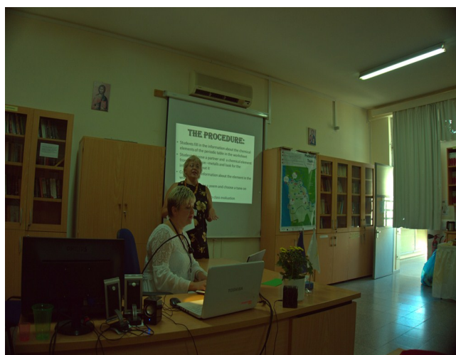
Presentations of Latvia team

Teachers can work with students individually at the computer or using an interactive white-board frontally.