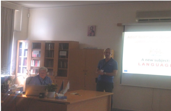
Presentations of Germany team

Germany presented the approach " Teaching language " to teaching spelling to refugees. It is a special lesson "Language" which was introduced at Städtische Adolf-Reichwein-Gesamtschule several years ago and helped the students with migrant background to finish successfully and go onto the next higher level. Lessons in a new subject called "language", where the teachers try to enhance the linguistic competence in the German language of our younger German and multicultural students, who often have difficulties in understanding texts/producing texts.