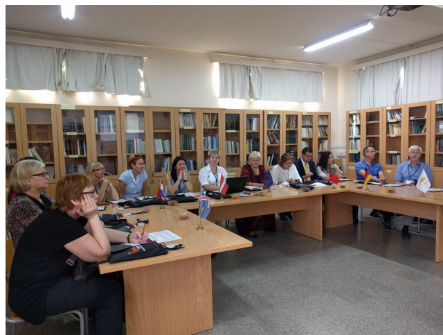
At the meeting