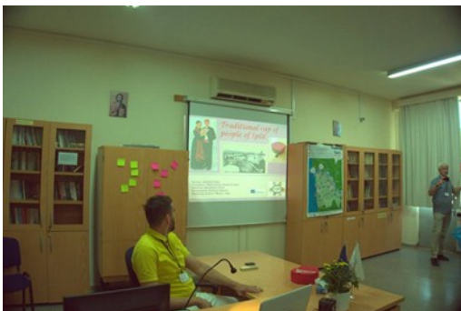
Presentations of Croatian team

The approach got an award for "language sensitive teaching" and the subject "language" that was developed at Städtische Adolf-Reichwein-Gesamtschule is now standard at many other schools. Both should help the students with essential basic linguistic qualifications that will make it easier for him to read, understand and produce texts of all kinds in all subjects.